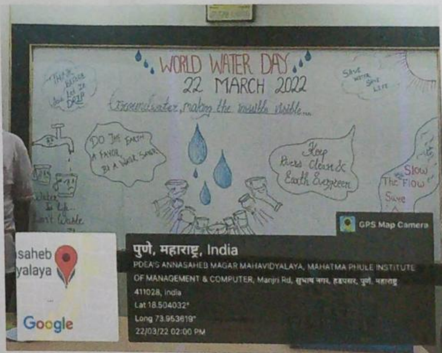
saheb yalaya पुणे, महाराष्ट्र, India PDEA'S ANNASAHEB MAGAR MAHAVIDYALAYA, MAHATMA PHULE INSTITUTE OF MANAGEMENT & COMPUTER, Manjri Rd, सुभाष नगर, हडपसर, पुणे, महाराष्ट्र 411028, India Lat 18.504032° Long 73.953619° 22/03/22 02:00 PM