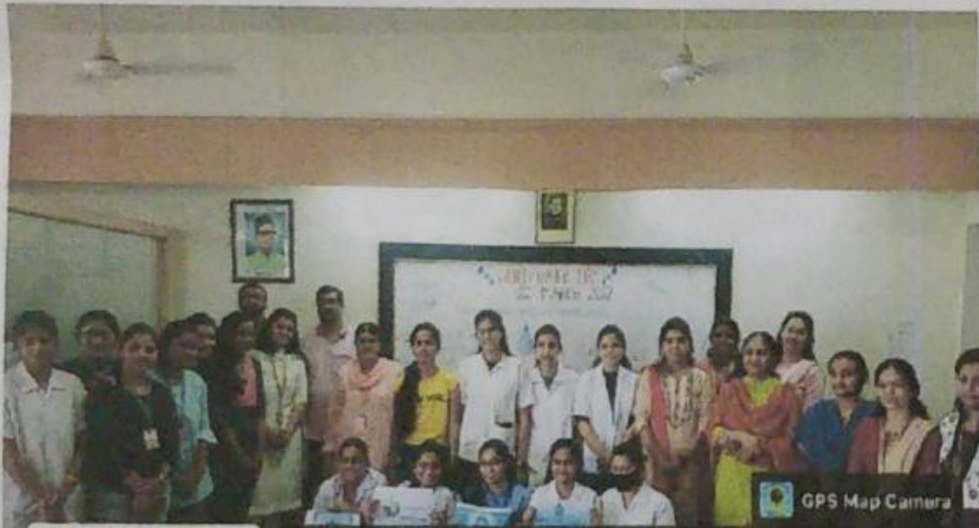
saheb yalaya पुणे, महाराष्ट्र, India PDEA'S ANNASAHEB MAGAR MAHAVIDYALAYA, MAHATMA PHULE INSTITUTE OF MANAGEMENT & COMPUTER, Manjri Rd, सुभाष नगर, हडपसर, पुणे, महाराष्ट्र 411028, India Lat 18.504031° Long 73.953614° 22/03/22 02:06 PM