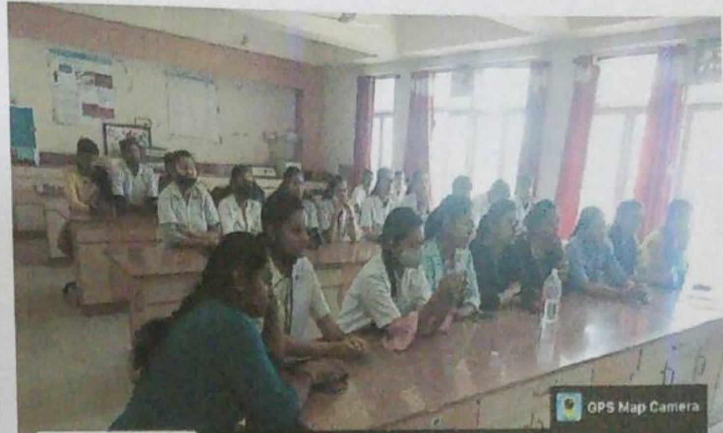
saheb yalaya पुणे, महाराष्ट्र, India PDEA'S ANNASAHEB MAGAR MAHAVIDYALAYA, MAHATMA PHULE INSTITUTE OF MANAGEMENT & COMPUTER, Manjri Rd, सुभाष नगर, हडपसर, पुणे, महाराष्ट्र 411028, India Lat 18.504027° Long 73.953607° 22/03/22 01:50 PM