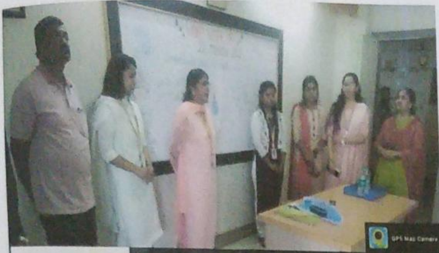
saheb yalaya पुणे, महाराष्ट्र, India PDEA'S ANNASAHEB MAGAR MAHAVIDYALAYA, MAHATMA PHULE INSTITUTE OF MANAGEMENT & COMPUTER, Manjri Rd, सुभाष नगर, हडपसर, पुणे, महाराष्ट्र 411028, India Lat 18.504028° Long 73.95361° 22/03/22 01:52 PM